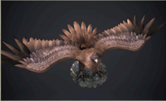
Top: The creature Dark II's Mantle in 2D track Bottom: The white High II War Eagle, instant before optimization